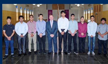
Salesian College Chadstone 2014 over 95 ATAR recipients