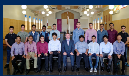
Salesian College Chadstone 2014 over 90 ATAR recipients

10 Bosco Street Chadstone Victoria Australia 3148