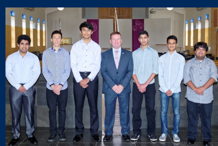
Salesian College Chadstone 2014 over 97 ATAR recipients