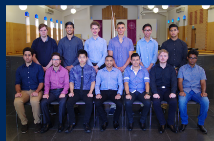
Salesian College Chadstone 2015 over 95 ATAR recipients