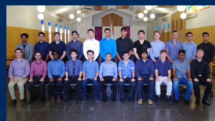
Salesian College Chadstone 2015 over 90 ATAR recipients